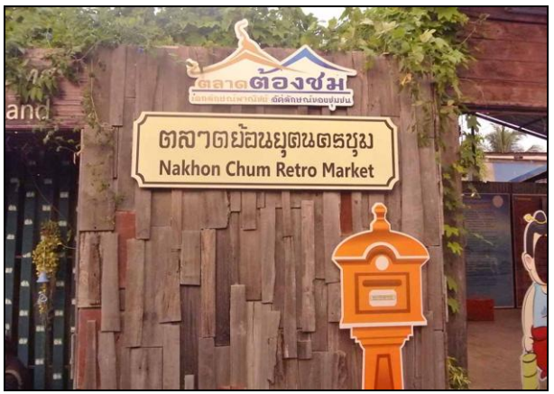
Fig. 2. Nakorn chum retro market.

The event has been held once a month along Nakorn Chum Walking Street (see, Fig. 3). This event aims to display their cultural heritage by having local people dress up in the traditional Thai style costumes, selling the traditional food and handicrafts surrounded by the ancient Thai-styled wooden houses in the area to create a feeling of nostalgic sentiment and to draw the tourist's attention in order to increase the income for the community by using the existing resources of that community.