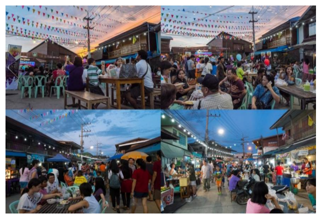
Fig. 3. The walking street with local food stalls during the Nakorn Chum retro market week.

In practice, this whole idea is not yet successful enough for the local people to earn more income and number of tourists visiting Nakorn Chum are still less than the local people within the community itself. Furthermore, Nakorn Chum is situated deep inside the province and is quite far away from the city center. Also, there is limited public transportation in the community, so it can be accessible mainly by private cars and motorcycles.