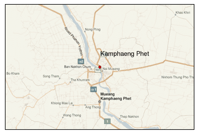
Fig. 1. Nakorn Chum Sub-district and the surrounding area.

Kamphaeng Phet Province, the lower northern province of Thailand and 350 kilometers away from Bangkok (see, Fig. 1). Nakorn Chum has a long and interesting history. The familiarly known history of Nakorn Chum dates back about a century, when Nakorn Chum was the center of commerce and junction of water transportation, because the city was built along the river and canal: Ping River and Klong Suan-Maak canal. Thus, Nakorn Chum was most prosperous for 200 years (around 1200-1400) after that people moved to the opposite side of the Ping River (Kamphaeng Phet Province at present). This is due to the effect of river bank erosion that collapsed the Nakorn Chum city's wall. Then, Nakorn Chum city became a small city with subjected to the Ayuttaya's monarch [2]. Also, Nakorn Chum is a small community with plenty of natural resources which are suitable for settlement.