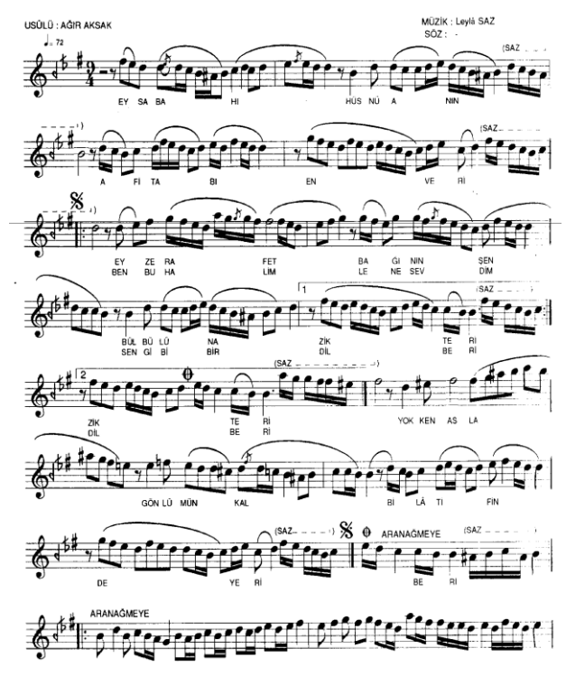
Fig. 1. Example of the musical notes.

The repeat section of the work which is the instrumental passage starting at the time zone of last one and half crotched in the fourth scale and continuing until the first two crotched time zone of the repeat section. Following this passage, the lyrics of the repeat section is read right after the time zone which was shown with the sign of quaver-rest. The lyrics of