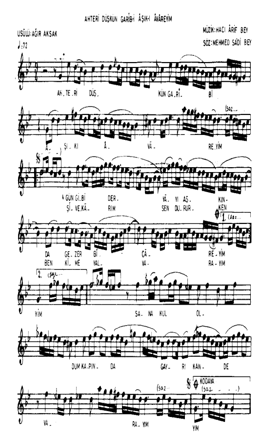
Fig. 2. A different sample piece.

5) Ah te rî düş kün ga rî bî â şı kî â vâ re yim Gün gi bî der yâ yı aş kın dâ ge zer bî çâ re yim Sa na kul ol dum ka pın dâ gayrı kân dâ vâ ra yım Şî ve kâ rım sen du rur ken benki me yal vâ ra yım